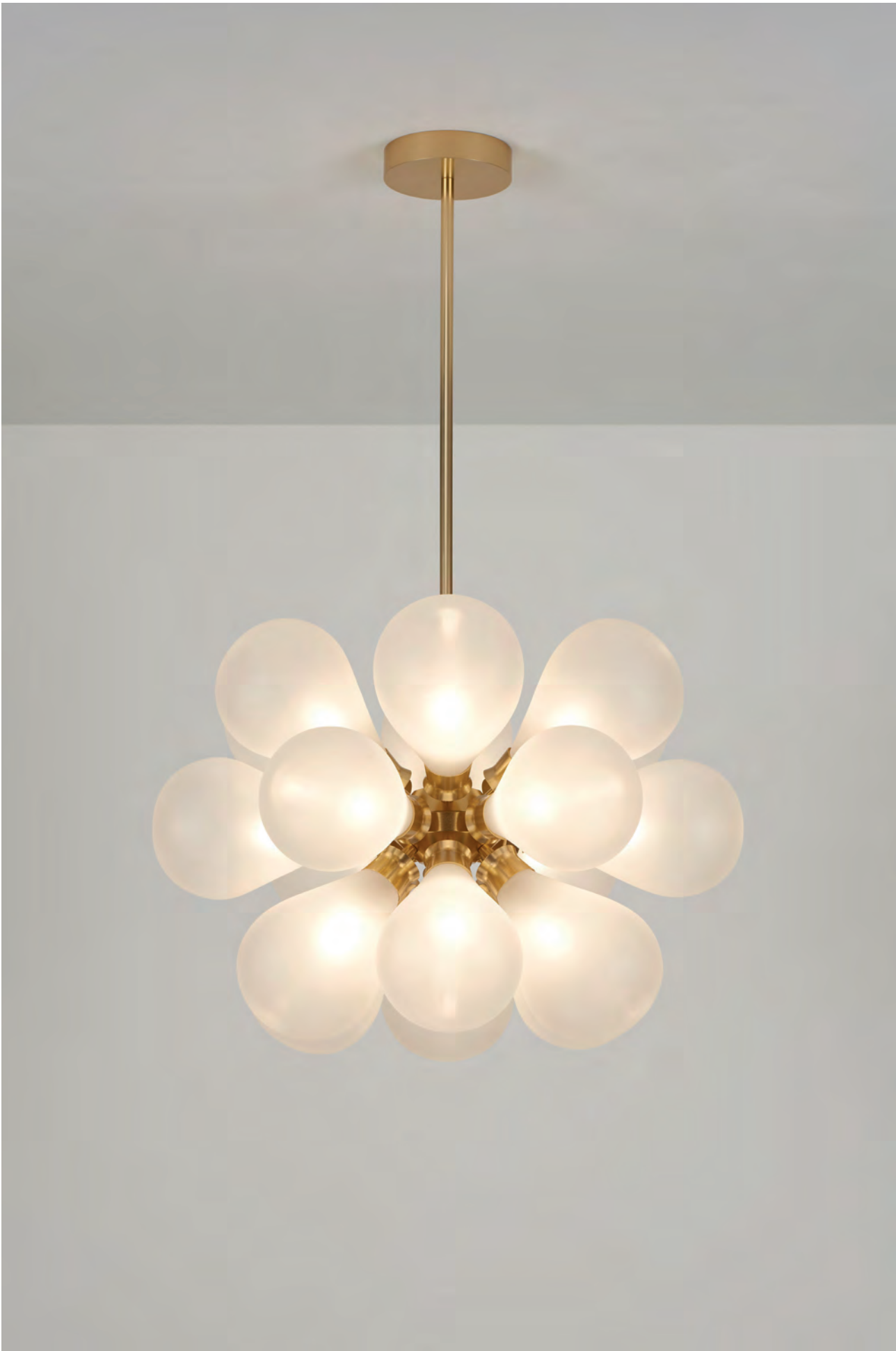
Cintola Maxi Pendant