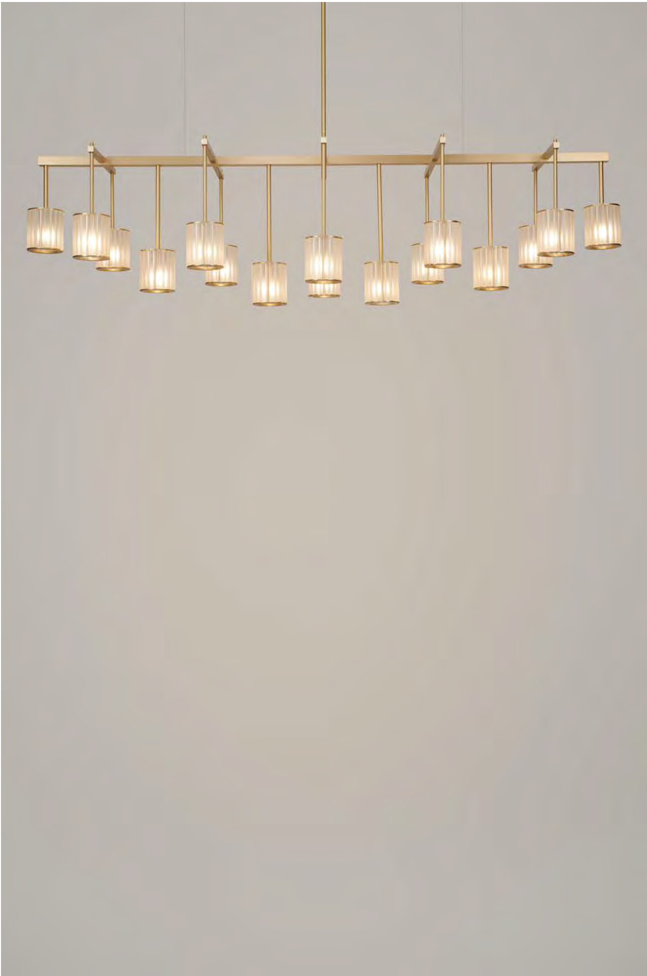
Flute Beam Chandelier