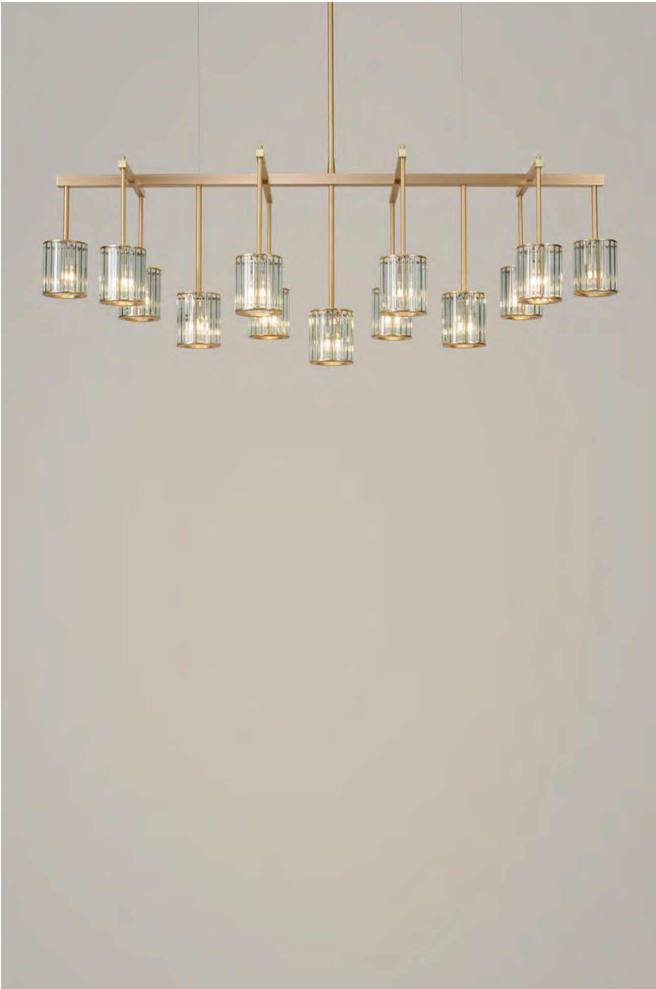
Flute Beam Chandelier