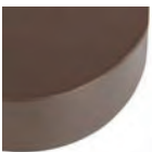
Powdercoated RAL colour