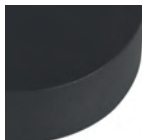
Matt-black Powder coat