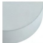
Matt-white Powder coat