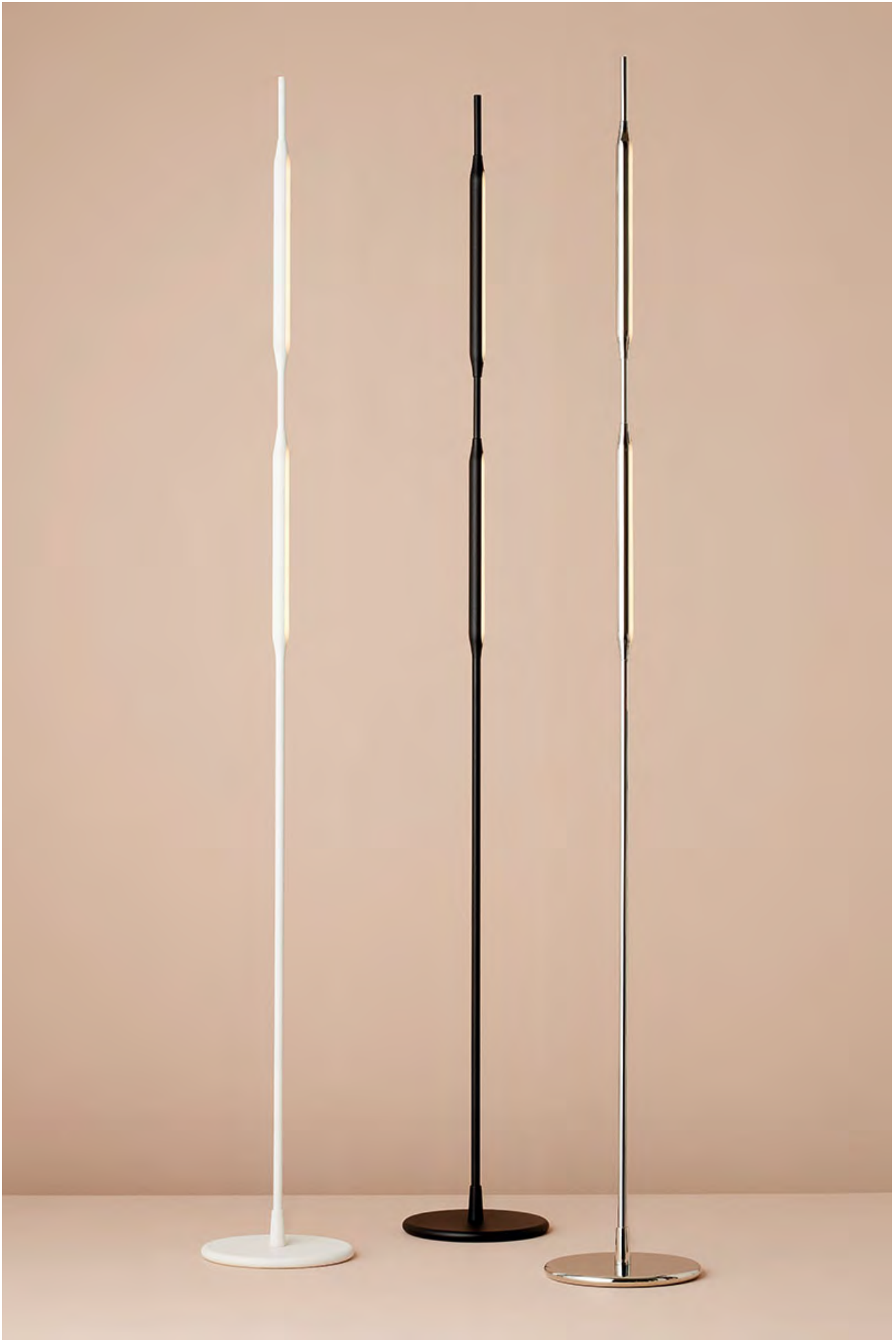
Reed Floor Light